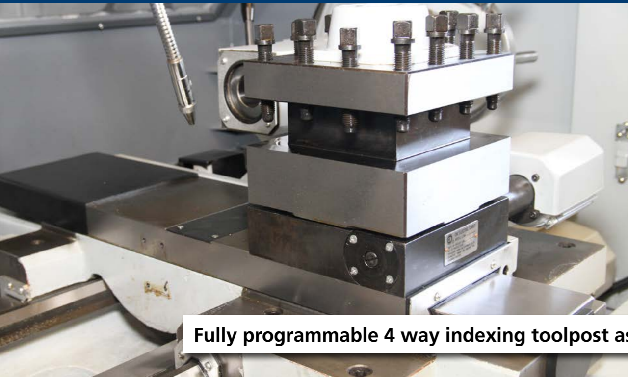
Fully programmable 4 way indexing toolpost as standard