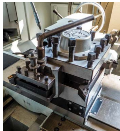
Optional adaptor to hold Q/C holders in position and manually change tools