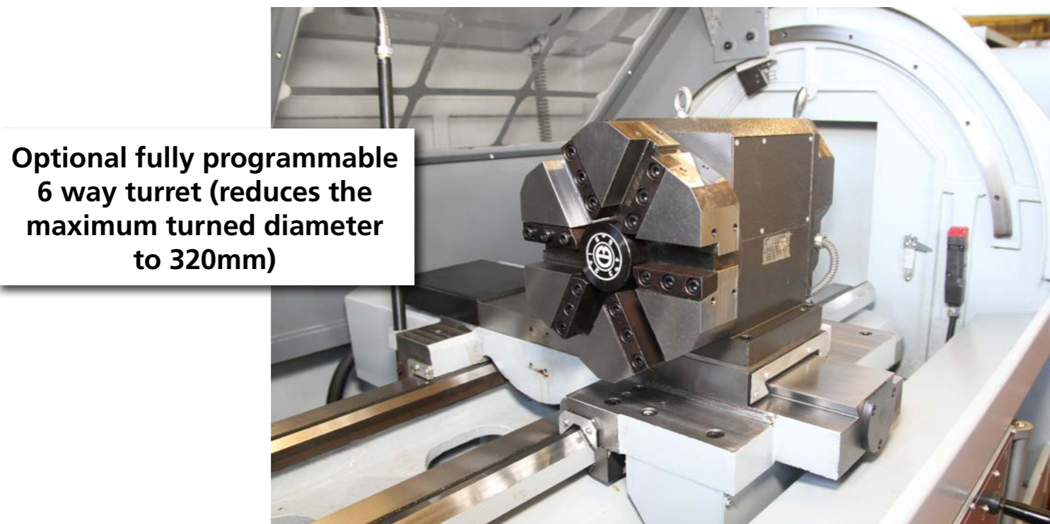
Optional fully programmable 6 way turret (reduces the maximum turned diameter to 320mm)

Fully guarded ball screws, extra wide double box way bed design for high rapid traverse and the capability to carry heavier work loads. The bed is also designed to allow easy unobstructed chip flow into the swarf tray or optional chip conveyor