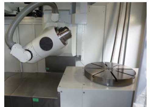
B axis swivel milling head