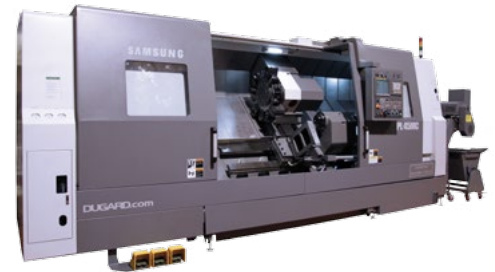
Samsung PL45MC (demonstrations online)

Most machines on our website have full brochures, with demonstration videos for various models (including the PL25MC, PL45MC, PL2500SY and a cutting demonstration for the PL35) - take a look here first then book your demonstration (or delivery!) with us today!