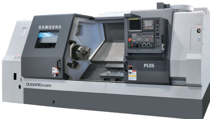
Samsung PL35 (cutting demo online)

Further information available at www.dugard.com