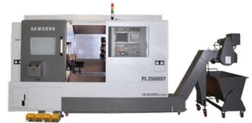
Samsung PL2500SY (demonstrations online)

Samsung machines are always in high demand so at Dugard we like to make sure we have healthy stock levels. From the smallest to the largest model, if they're in stock they're available for immediate delivery!