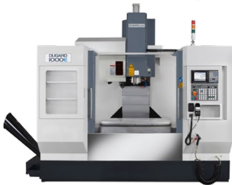
Dugard 1000E VMC

MACH 2014 is looming large on the horizon so it's time to start doing some serious work in preparation. The good news is we're just about done with stand design and machine arrangement, now all we've just got to do is make sure everything falls in to place. This year we've got a really interesting selection of machines – lots of new models that we haven't seen at MACH before but are already gaining popularity from their introduction at EMO and our open house last year.