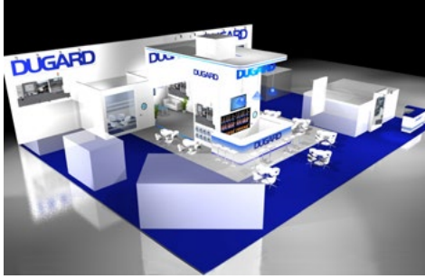
Dugard stand - MACH 2014